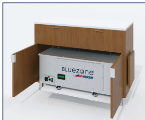
Plug & play cabinets designed to maximize airflow.