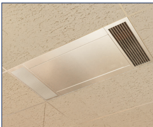
Ceiling Mount Kit replaces 2 x4 drop ceiling panel.