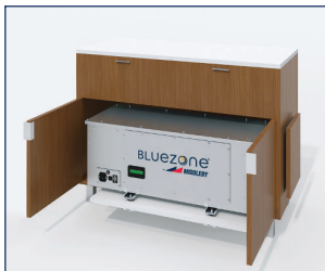
Plug & play cabinets designed to maximize airflow.