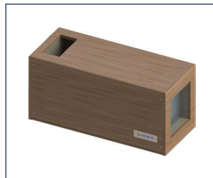
Wall mounted shelf enclosure conceals unit and optimized airflow.

Bluezone® by Middleby makes indoor dining and working spaces safe again with patented, ultraviolet air cleaning technology that kills up to 99.9995% of viruses in the air, including SARS-CoV-2 (corona-virus). Air is pulled into a chamber, is scrubbed of contaminants, and purified air is returned to the space.